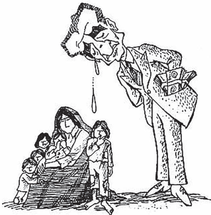
A cartoon published in Iran, 1979. The caption said, 'The Shah had a lot of sympathy for the poor.'