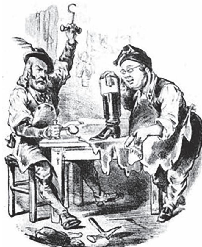
A cartoon from 1861 showing Cavour and Garibaldi making 'the boot' of Italy.

Piedmont has a thirst for power, a desire to destroy and rule. The unity boasted by Piedmont is a lie. Piedmont proclaims 'Away with the Austrian!', yet it enables another foreigner, the French, to penetrate into the heart of Italian lands. Piedmont cries 'Italy!', and makes war on Italians; because it does not want to make Italy – it wants to eat Italy. Our homeland, Naples, is not hostile to Italy but fights against those who say 'Unite Italy' in order to rob it. Naples wants to unite Italy so that it can advance in civilisation, not retreat into barbarity.